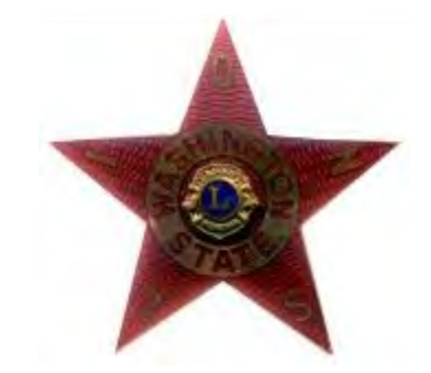
1977 Safety Pin Back