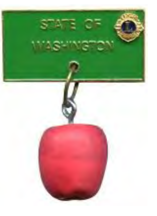
Date/Origin Unknown The emblem has been glued on and we have seen several sizes (smaller and larger without emblem & larger Apple