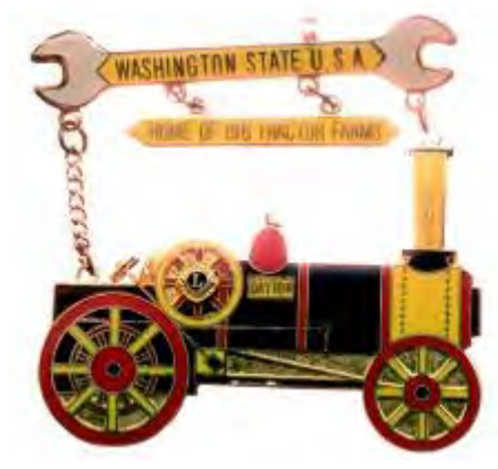
Dayton Washington Lions Club Pin