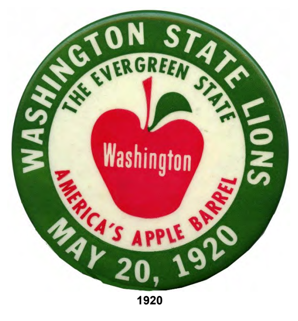
NOTE: This is a recent find and the only date that we can give is 1920, which is on the button. We are not sure if it was actually issued on the date shown or if it is a replica.