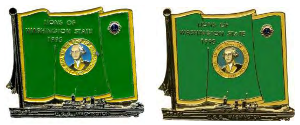
1995 Silver 1995 Gold These two ship pins were issued by a PDG of MD 19