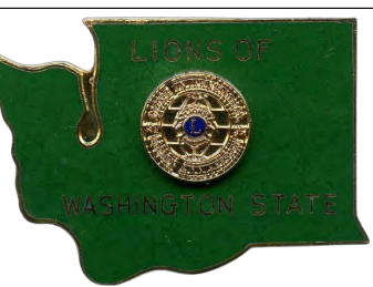
1967 Tie Tag